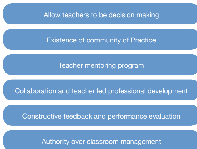
Figure 4: Key provision for teacher empowerment

Listed in figure 4 below are the provisions that should be in place to facilitate teacher empowerment.