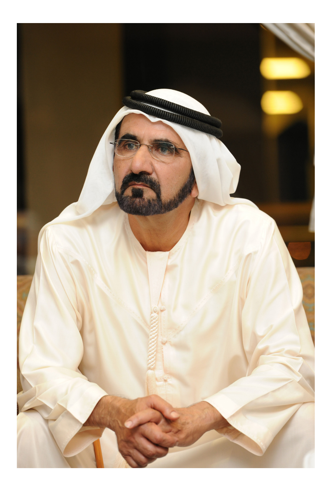
His Highness Sheikh Mohammed bin Rashid Al Maktoum Vice President and Prime Minister of the United Arab Emirates and Ruler of Dubai